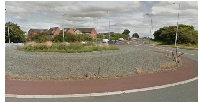
The Golborne East Lancs Roundabout before:

None – This enhancement was carried out on a voluntary basis and was not part of any permission or consent.