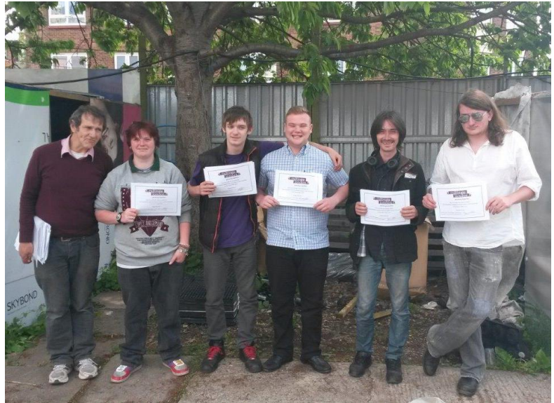
Photo: Apprentices trained at New Cultivate London Site

Mace has a core value 'Pursuit of a Better Way' and this project is a prime example of how it is possible for construction projects to operate in the community in a better way and build lasting relationships benefiting not only future biodiversity and sustainability but educating the local community.