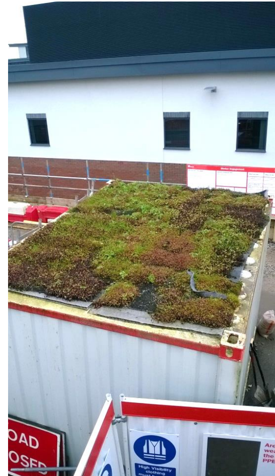
Site cabin Green roof

The highlight however has been the green roof on top of the crew and ops building. This is a new habitat created in the centre of town. This was laid in the summer. On a sunny day the amount of insects and bees that is attracted to the area is wonderful. This provides a wonderful view for the local residents who overlook the project. There was some excess green roof material left over the site team volunteered to place over the roof of a site cabin to further enhance the wildlife. It is possible to view the wildlife enjoying this from the 2 nd tier site cabin. Which brings enhancement to the work force as this was enhanced green space.