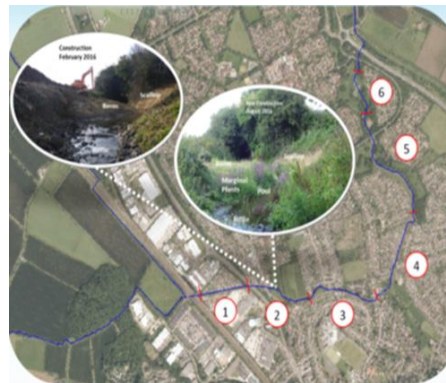
Werrington Brook improvements Location map and before / after pictures.

The Water Framework Directive requires rivers to reach certain standards. This heavily modified, urban water has a moderate status and sediment issues resulting in high maintenance requirements. The course of the brook runs through numerous public amenities. A key partner objective was to create a long term legacy of community involvement, a reduced need for maintenance and an increased resilience within the watercourse to climate change and pollution incidents.