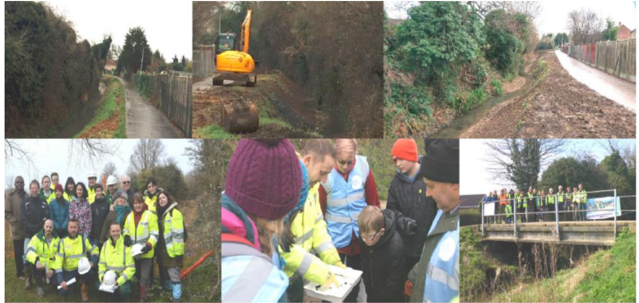
Top Row – Ullswater Avenue Before / During / After. Bottom left - Team Photo, followed by River Care Day

The access strip was constructed with a long reach excavator and where space was limited a smaller excavator was used to create the new features (as pictured). Small dumpers were used to transport material along the reach and consideration was taken to limit the impact on the local residents in terms of working hours and notification of when the work was taking place.