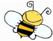
Photo: Bees for a better world summer school quote