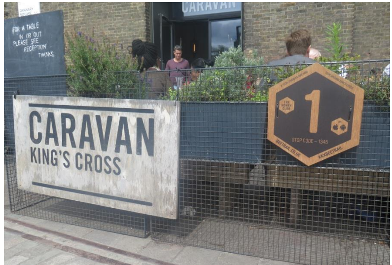
Photo: Caravan restaurant and bee trail stop

Numbers – 15 Better World Ambassadors, 15 local resident Twilight Gardeners, 318 people downloaded the app in the first ten days.