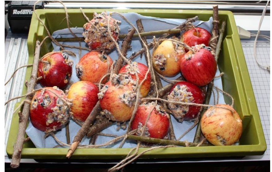
Bird feeder made by the pupils at Horsford C of E