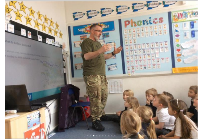
Engaging with local school children

We have supported the East Winch RSPCA Wildlife Rescue through volunteering days and also with donations to a number of their appeals, in addition funds are continuously raised for the East Anglian Ambulance. In total over £6000 has been raised by staff and operatives for a number of good causes.