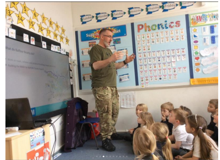
Engaging with local school children

The project was subject to a 'Development Consent Order' which is very specific and doesn't leave much 'wiggle' room for changing things unless you want to progress it by trying to change planning conditions, however the DCO was instrumental in respect to getting the project through the planning process and although Balfour Beatty are constructing only there has been a real team effort (especially from an environmental/sustainability/biodiversity) to ensure any delays are avoided. The project is due to be completed in early 2018