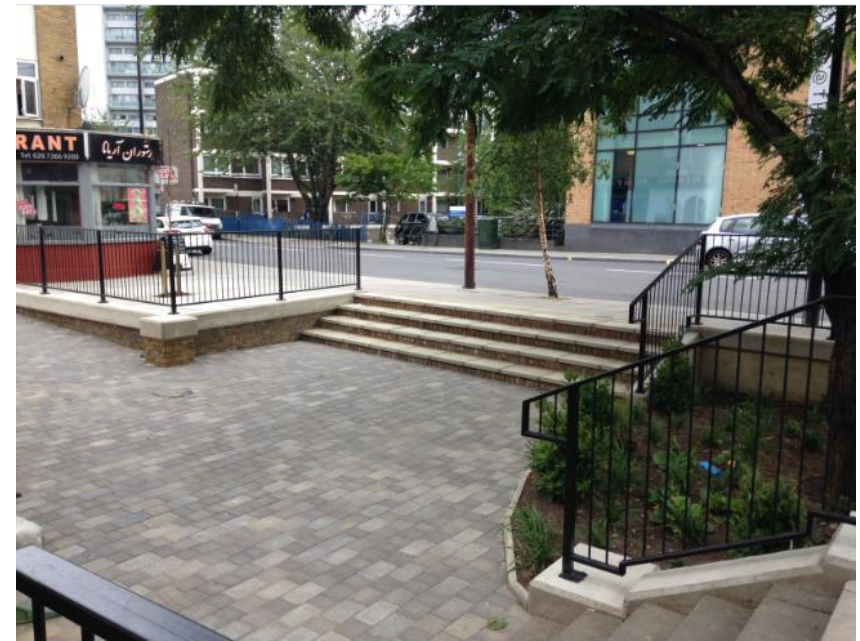
Before (left) and after (right) photos of the Pit. A concrete sunken area with flower and shrub beds was replaced with a raised, soft and hard landscaped area that featured a green wall and shrub beds.