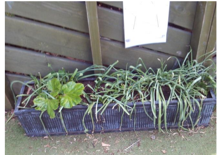
The Nursery Planter (just about to flower...) (Mimi, FCN)