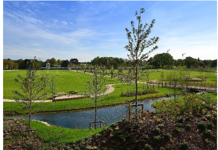
Cator Park, Kidbrooke Village, Greenwich

By committing to creating a net biodiversity gain on all new sites, we demonstrate our commitment to the natural environment, to having a positive effect on the places we create, and to helping to address UN Sustainable Development Goal 15: Life on Land. At the time of launching our commitment, no other developer had committed to improving biodiversity across all developments.