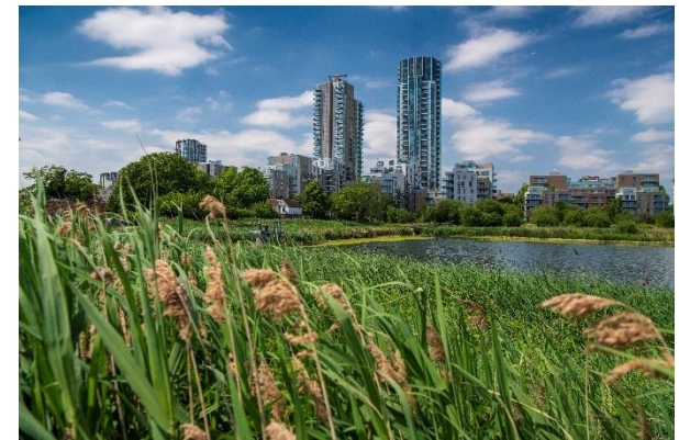
Woodberry Wetlands, Finsbury Park