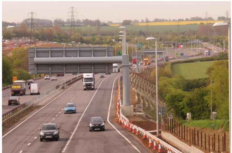
Photo: Planted embankment

The aim was to influence the retention of existing habitat and ensure that permanent losses were compensated for with enhancements to retain and attract new species.