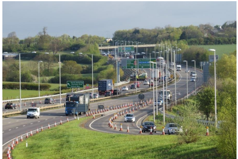
Photo: Road Overview

The area adjacent to the scheme was heavily dominated by agriculture