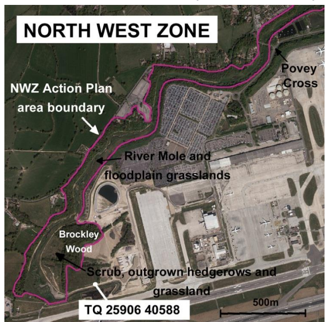
Photo: North West Zone BAP boundary