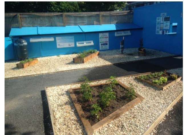
Vegetable garden at Hull University:

Interserve has a target to improve biodiversity on all our sites. The Allum Medical building site team wanted to create a pleasant working environment and improve the biodiversity during the construction phase of the building.