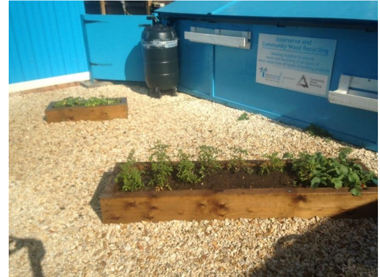
Vegetable planters at Hull University Allam Building:

Several keen gardeners on site and a desire to enhance the area with a small amount of green space, making a better environment for both wildlife and workers alike.