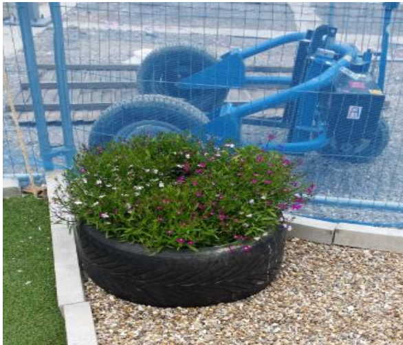
Photo: Flowers planted in old tyre, relevant to the client as they are Bussey's Car Dealers.

The initial motivation arose from wanting to create a smile on people's faces while helping the bees with their pollination.