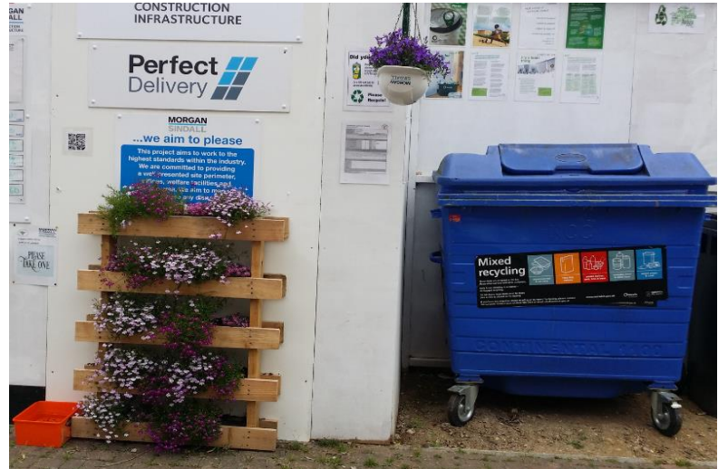
Photo: Front entrance with planting in a recycled pallet and hard hat, talking point to passers by and people entering

There is also a drive to improve the image of construction to the wider public and those who work on our sites. In the absence of the area we have taken up it is an enhancement for public, workforce and a consideration to the birds, bees and any other wildlife we can help in anyway however small.