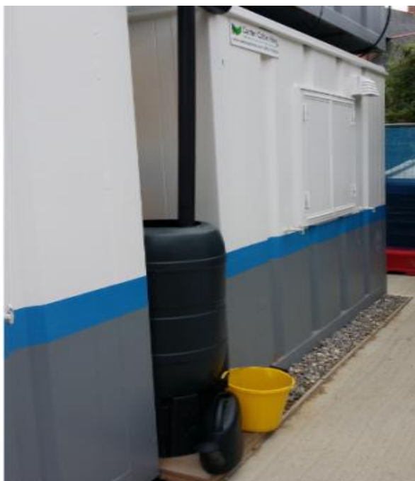
Photo: Rainwater Harvesting