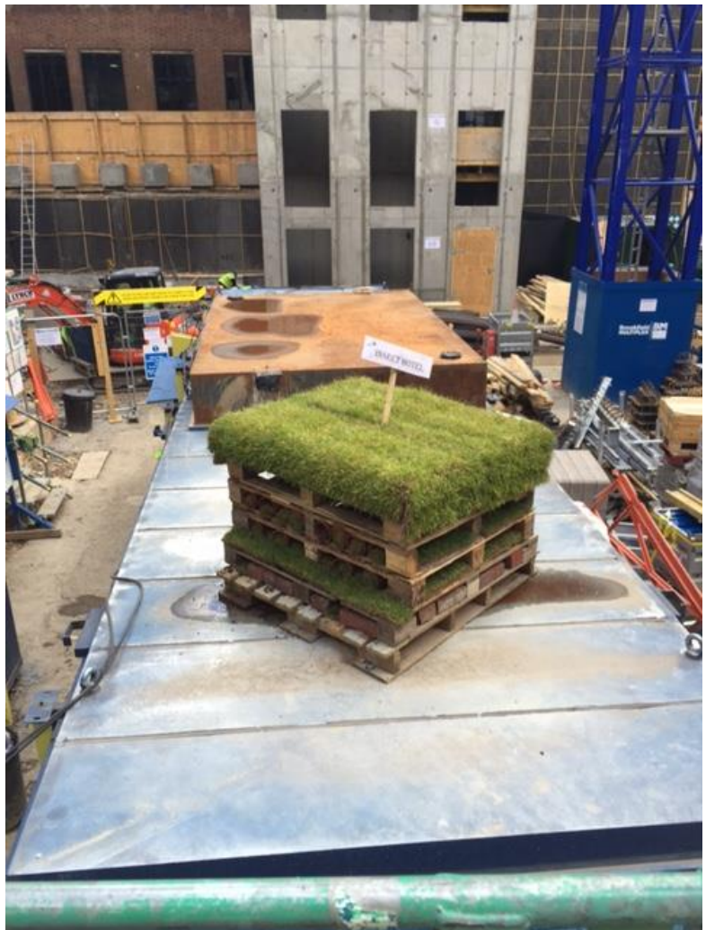
Photo: Bug hotel

Working in the environmental/sustainability field, it is important to mitigate construction impacts on the surrounding area.