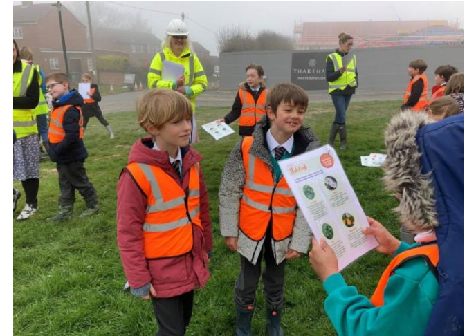
Children at Woodgate, Thakeham's flagship development in Pease Pottage