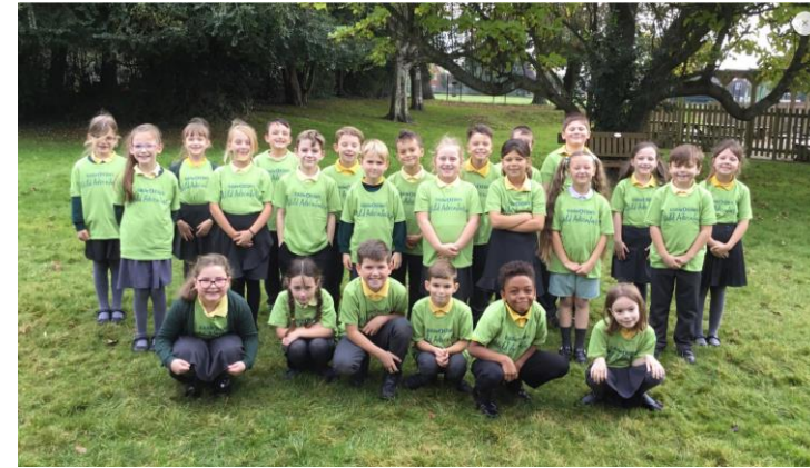
Schoolchildren take part in the education programme