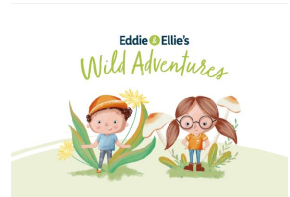
The Eddie & Ellie Wild Adventures educational storybook

Delivering social value and enhancing and protecting the natural world is an intrinsic part of Thakeham's culture; we are a Pioneer member of Social Value UK, the professional body for social value, and The Eddie and Ellie's Wild Adventures programme is a fundamental part of our social value strategy, driving one of our key goals – 'Building Future Generations'. Created in consultation with educational specialists, parents and children, Eddie and Ellie is curated to leave lasting impact long after developments are completed through a legacy of children engaged with their environment.