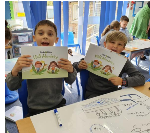
Children enjoy an Eddie and Ellie workshop