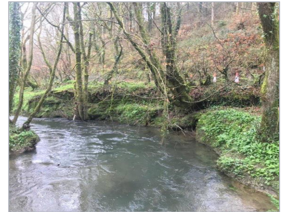
View of highway original retaining wall and river (Cormac).

Initially this project was commissioned by purely as a highway retaining wall strengthening and safety improvement scheme. A river diversion was considered during the feasibility study phase, this option was preferred by the Environment Agency. A river design was developed by Cormac/Cornwall Council working collaboratively with the Environment Agency to: create more space for the river to move without affecting the road, remove the historic bunds which disconnect the river from the floodplain and increase erosion, reduce the risk to existing mature trees and improve in-channel habitat quality.