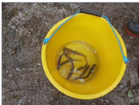
Fish capture & rescue (Cormac).

The woodland is owned by Cornwall Council, is enjoyed by the local community being popular with walkers and is monitored by the local ranger. The area identified for improvement has become a wet woodland and the re-planted trees are becoming established. The River Seaton is an Environment Agency asset managed by their specialists. Fish spawning at the site is being monitored for improvement.