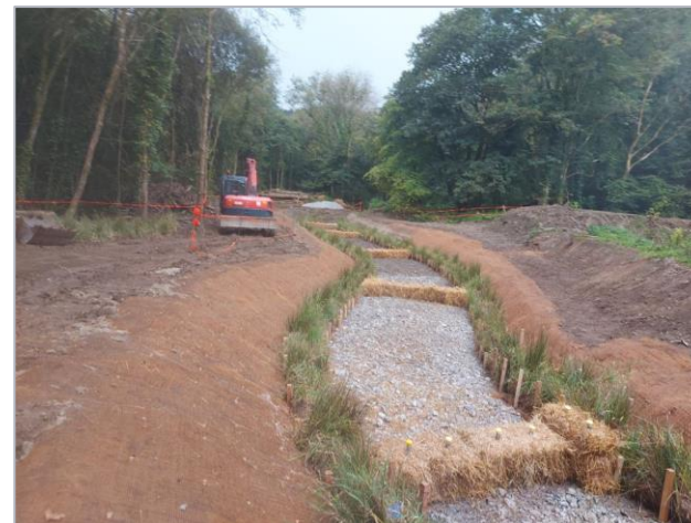
River diversion during construction (Cormac).

key lesson learnt: Fully review the specification, after the successful install, plastic netting was noted in the hessian matting, an unnecessary design component. The diversion channel re-entered the existing river too perpendicular to the flow, a leaky dam constructed from felled trees was needed to address scour issues.