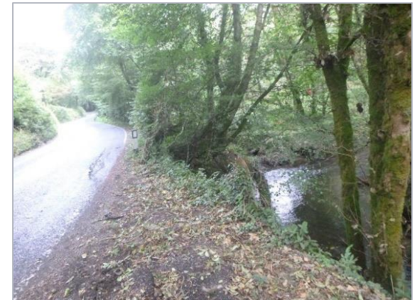
View of highway defects and original river position (Cormac).