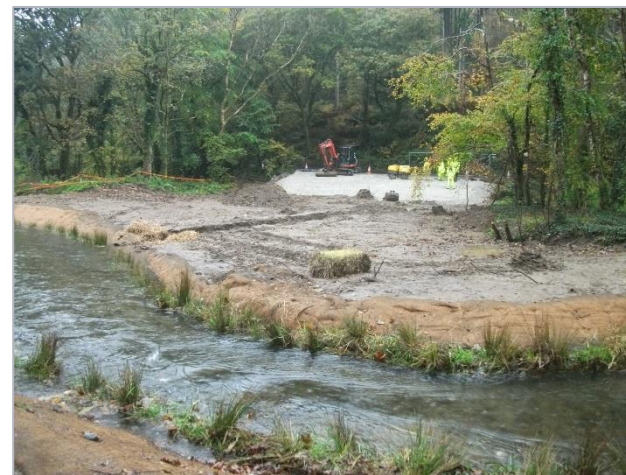
View towards highway embankment and infilled river Seaton during construction (Cormac).