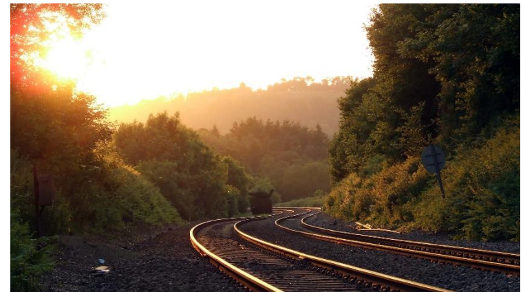
The biodiversity opportunity for the railway is bright