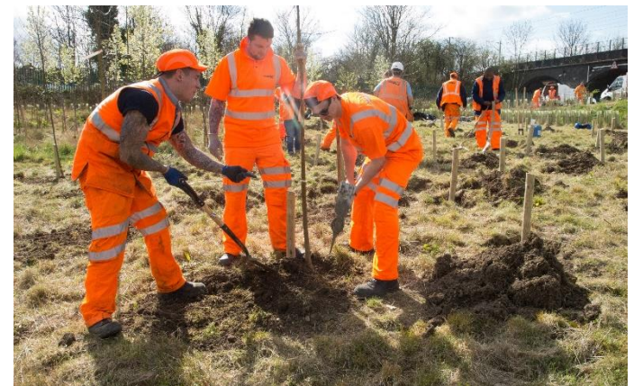
With correct habitat data, work with communities can be targeted