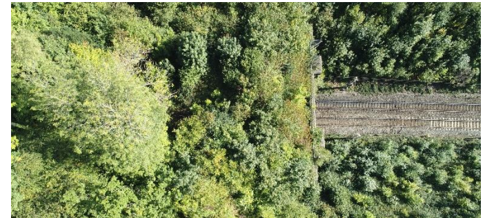
The Network Rail lineside estate

The railway needs constant management to keep passengers, front-line staff and trains safe. Our man-made assets are well known and understood. Environmental assets are less well recognised and often seen as a liability. Knowledge of the habitats alongside the railway can help with planning work on the estate. Work can then consider the types of habitat or species that may be impacted. We can schedule work appropriately and make plans for mitigation or offsetting if needed. The corridor of data we have through the British countryside will help us work with adjacent stakeholders for the benefit of people and nature.