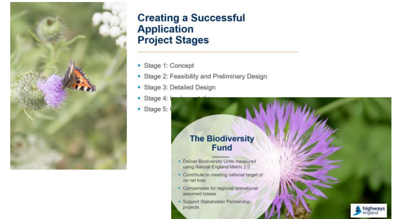
Image of slide from training course