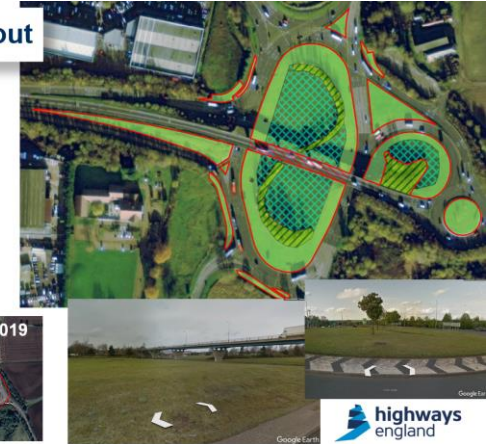
Habitat Intervention proposed within the Highways England Estate