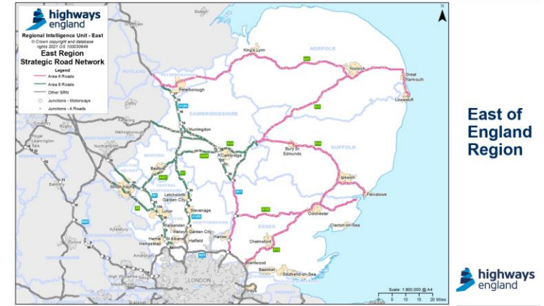
East of Region Network opportunity search area

This project was inspired by Highways England’s national commitment to work towards biodiversity net gain. Stakeholder engagement is key to achieving this, but the team were concerned that the funding opportunity was not well enough known, and potential partners wouldn’t know where to start in making applications. We passionately wanted to ensure that this funding gets used to deliver genuine benefits to wildlife and local communities on the ground. Highways England & Department of Transport have been visionary in creating the ringfenced national fund, and our motivation was to make the East of England region an exemplar of its use.