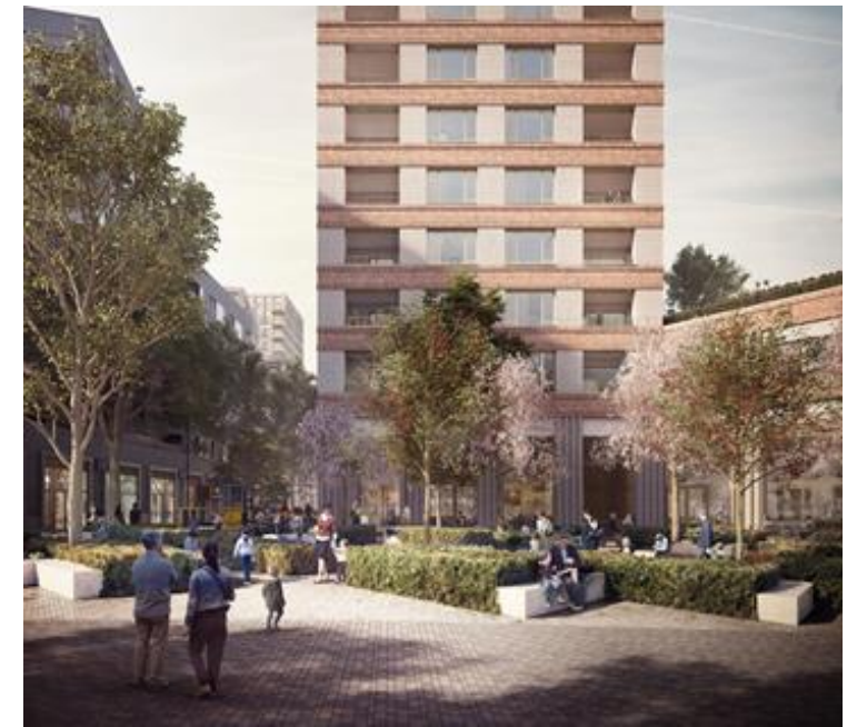
Communal podium gardens and biodiverse roofs of at Hallsville Quarter Phases 1 and 3.