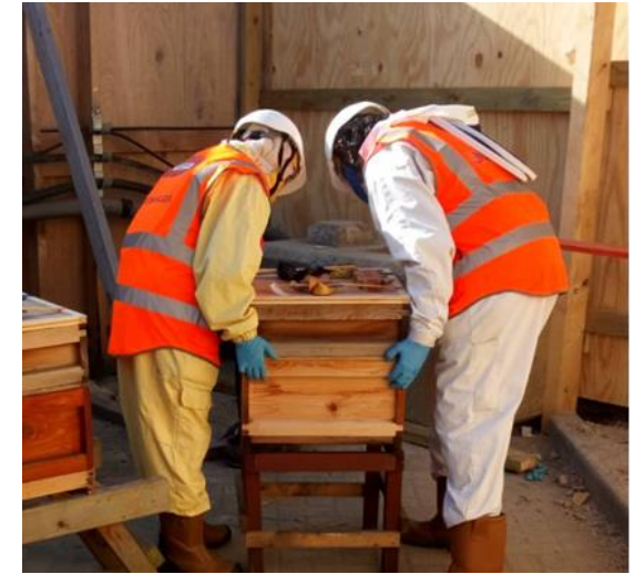
Beehive installation works at Hallsville Quarter Phase 3 site

Another motivation for Bouygues and Linkcity was to positively contribute to the socio-economic development of the area by employing a local small business like Bushwood Bees. All being very much in line with Bouygues’ Responsible and Committed policy and the UN 2030 Sustainable Development Goals.