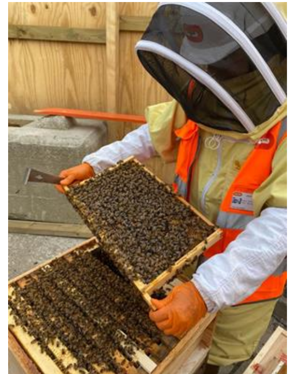
Bee colonies at Hallsville Quarter Phase 3 site