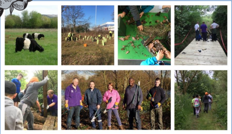
Showing different management in action; volunteers helping with habitat management, tree planting post project, cattle grazing near T5 and engagement activities with local school children.

The motivation of the biodiversity management was the belief and dedication from Heathrow Airport Ltd that they could implement long-term and effective biodiversity management. The drive for the biodiversity management comes from a range of people from the Chief Executive and the Engineering Team to the dedicated staff conducting the habitat management on the ground. We have developed a strong commitment to biodiversity management that will endure for many years.