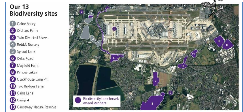
Map of the Heathrow Biodiversity Sites showing how they provide connectivity across the landscape.

Heathrow recognised the potential for managing its landholdings for biodiversity enhancement nearly 20 years ago. This has been consolidated into structured and effective biodiversity management that ensures Heathrow meets its commitments of both conservation legacies as well as ensuring Heathrow is able to meet future environmental challenges. To ensure the biodiversity management continues to deliver outcomes beyond normal business practice Heathrow has developed key policy commitments. These are found within the Energy and Environment Policy and the Heathrow 2.0 strategy. This ambitious strategy sets targets across the sustainability agenda and includes ensuring biodiversity protection and enhancement during development as well as maintaining the effective site Biodiversity Site management currently in place.