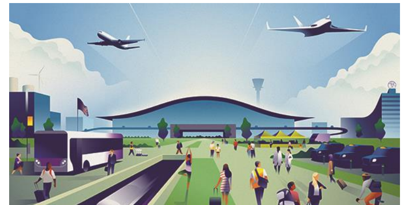
Heathrow 2.0; an ambitious sustainability agenda.