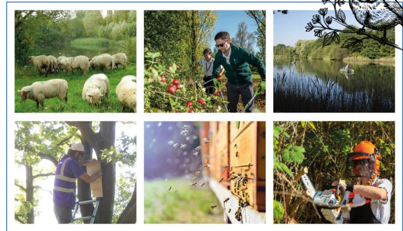
Photos showing examples of the varied management on the biodiversity sites. Including grazing, habitat managements, coppicing, honey bees and example of water treatment infrastructure sitting alongside wildlife habitats.

We work closely with the local community engaging with schools and groups. We are also active with local biodiversity partnership organisations. This helps to ensure our biodiversity management complements what is going on in the local area.