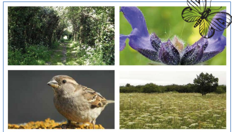
These picture provide an excellent example of a public access site providing an important green space for the local community. This allows members of the public access to nature within an urban area and may help improve their mental health as well as well as having environmental benefits (Oaks Road pictured):