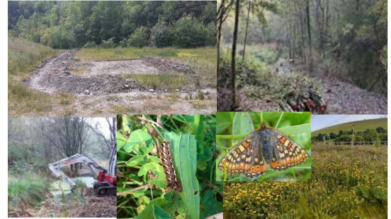
Beetle scrape and bank, habitat piles, pond excavation, knot grass moth caterpillar, wildflower planting, marsh fritillary

Monitoring includes quarterly site visits by an ecologist and the landscape contractor to review management and identify remedial actions combined with annual habitat assessments. Annual reports and update species surveys feedback into the management which will be continually reviewed and amended where required to ensure the legacy of the site.