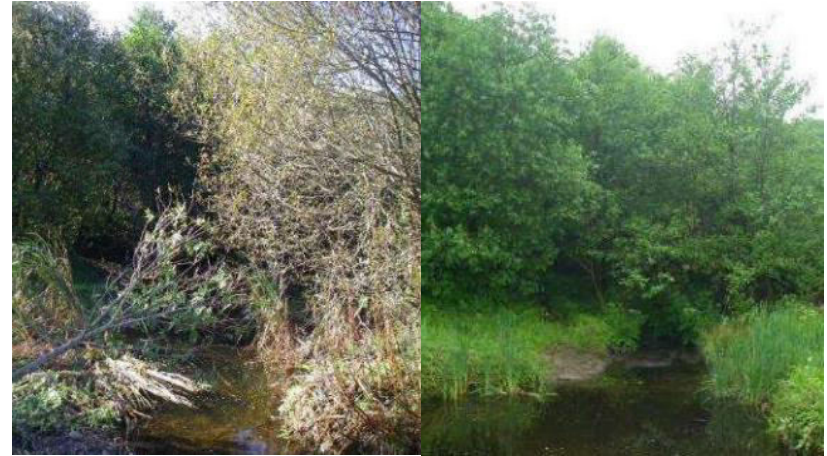
Wetland area Year 0 and Year 1

The Welsh Government are committed to reversing the decline in biodiversity in Wales by delivering Net Benefit for Biodiversity and increasing the resilience of its ecosystems (Diversity; Extent; Condition; Connectivity; Adaptability). They have the vision that the employment site will continue to reflect the local history and ecological value of the site, whilst providing access to natural spaces for local residents and employees at the site. The design of plots balances the needs of biodiversity whilst ensuring a viable employment-led development can be delivered in deprecation areas. Parc Coed Elai will become an exemplar of how similar employment sites on ex-coliery sites in South Wales can be actively managed to deliver value for business, biodiversity and the community.