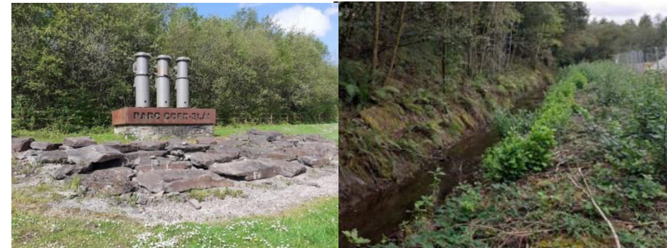
Creation of more brownfield through scrub clearance especially alongside drainage channels and adjacent to woodland

Multiple landowners and developers are involved in the development. To ensure that the biodiversity vision and public benefits are realised, Arcadis are working with the client and stakeholders to ensure that advanced site-wide habitat is delivered via the design guides and the LHMP and that plot development is in line with these designs and management vision. |