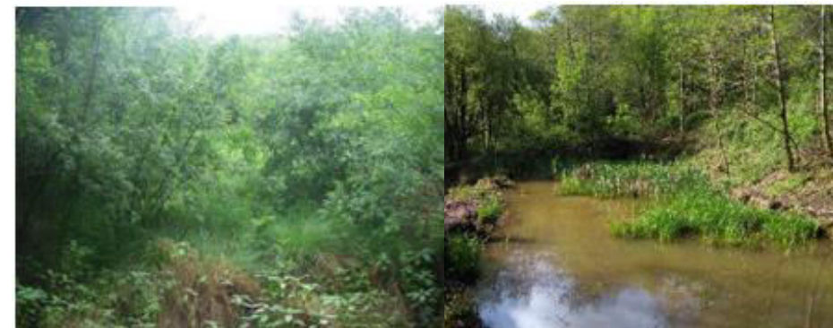
One of the ponds before and after clearance