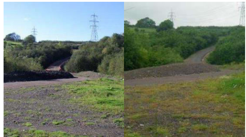
Central Bund Year 0 and Year 1