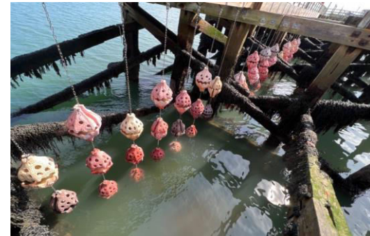
Shelter Shells at Commissioner's Quay in Blyth

This project will help to restore lost habitat and increase biodiversity and water quality. The aim is to offer some defence in the fight against climate change by increasing intertidal habitat, which is at risk due to sea-level rise and coastal development. The Shelter Shells will increase biodiversity net gain through providing habitat for juvenile fish, crustaceans, and corals. They also attract and connect the community with their environment through an engaging sculptural aesthetic.