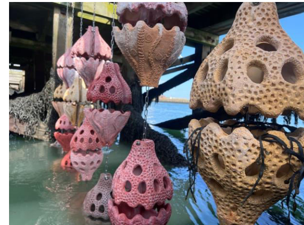
Shelter Shells being submerged by the incoming tide.