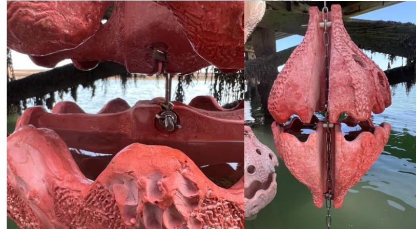
Shelter Shells with their lower halves filled with water to provide a tidepool-like oasis during low tide.

The motivation for this enhancement was to restore a degraded estuarine environment, allowing industry and nature to coincide. Our aim is to increase biodiversity, allowing fish, crustaceans and corals to once again live in safety, in what had become a habitat desert, while demonstrating to the local community the type of innovative nature-based solutions that are possible.