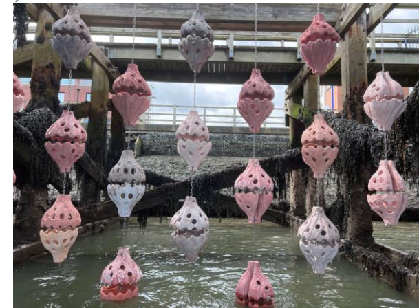
Shelter Shells Are Indexed Onto a Stainless Steel Chain