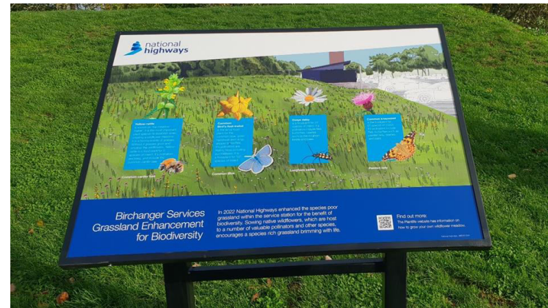
Information board explaining the biodiversity enhancements and giving the public a link to read more and discover how to create their own wildflower areas.