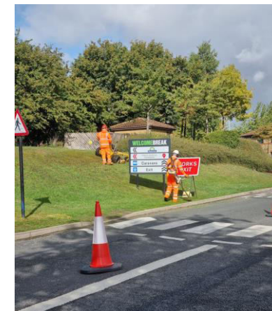
Mowing and scarification to prepare the Site for enhancement to species rich grassland.