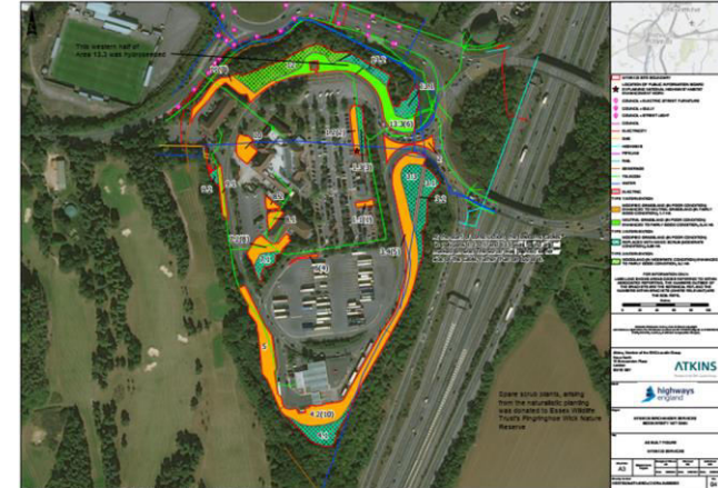
Birchanger Services proposed biodiversity enhancement works.

The design has formed a model to replicate throughout the region. A screening assessment of all the motorway service areas and rest areas within the entire East Region was completed in early 2023. The screening assessment identified ten of the 45 sites could be enhanced for biodiversity and achieve significant habitat units, based on the same design used for Birchanger Services. This may result in over 90 habitat units being achieved, over half of the annual regional unit target. Three of these service stations are managed by Extra who are very keen to collaborate with NH and are committed to managing the habitats in the long term. In this way NH can compensate for the environmental impacts of operations, thereby minimising the long-term impacts and they can enhance the quality of the natural environment on sites managed by partners.