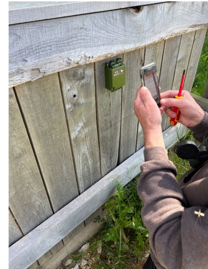
Audio recorder being installed.