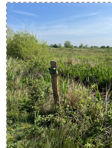
Audio recorder working 24/7.

Emerging new technologies could provide an opportunity to go beyond normal practices although many hadn't been proven to work for professional ecologists at especially at scale. We decided to innovate using bioacoustics and AI in the aim of provide a step change in the volume and quality of the data available to us with which to inform decisions on biodiversity through impact assessment to mitigation and compensation, in particular to inform more effective future habitat management approaches.