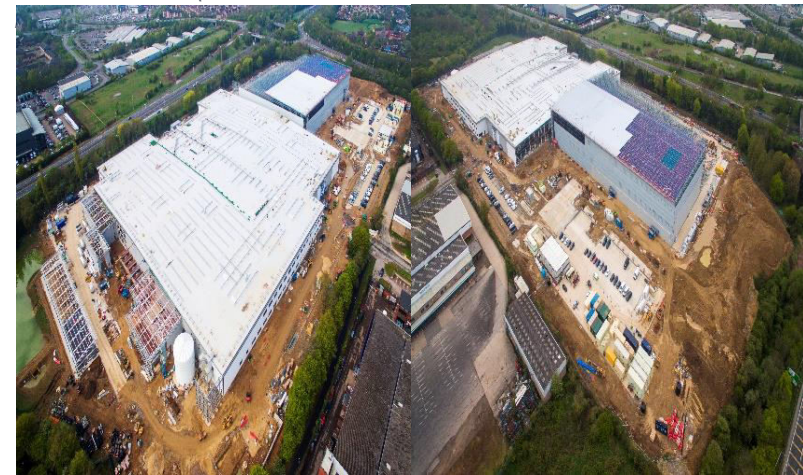
The Crown Packaging facility in development on the site – retained areas of open mosaic habitat can be seen along with new areas of habitat works