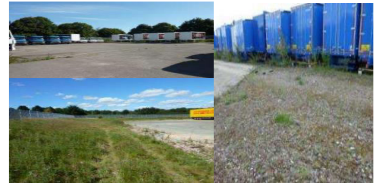
Pictures showing the site prior to the development - being used as a storage facility for lorry trailers.

Brownfield habitat is highly valued in the biodiversity metric. Following maximising brownfield biodiversity on site, Arcadis worked with the LPA, PCC, to create an offsetting scheme to deliver local biodiversity goals and deliver BNG. The scheme was selected via discussions with the PCC Wildlife Officer and PCC Natural & Historic Environment Manager. The proposal is to modify the management of the Protected Road Verges (PRV) across John Clare Country, in and around Peterborough. The intervention is funded by the development and will support improved management for a 30-year period.