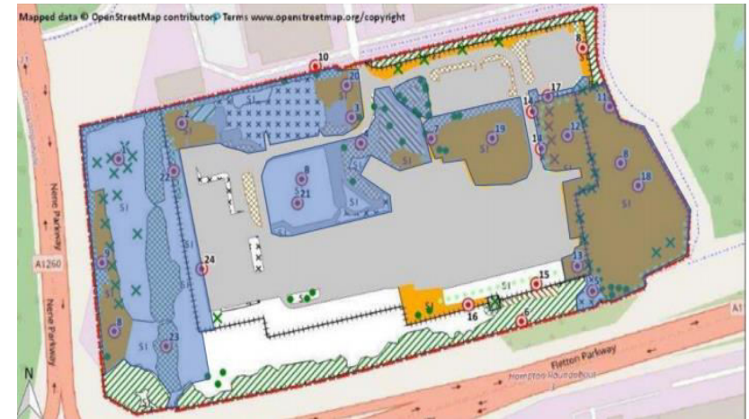
Map showing areas of site identified as supporting by Open Mosaic Habitat (shown in blue) – areas were retained on site where possible in line with the mitigation hierarchy.

The implemented methodology for reaching target habitat within PRV areas is a process of seeding and modified cutting / arising removal regime. Two cuts and collection of all arisings will be performed each year within the enhancement areas. Timings will be varied to match flower periods of plants present.