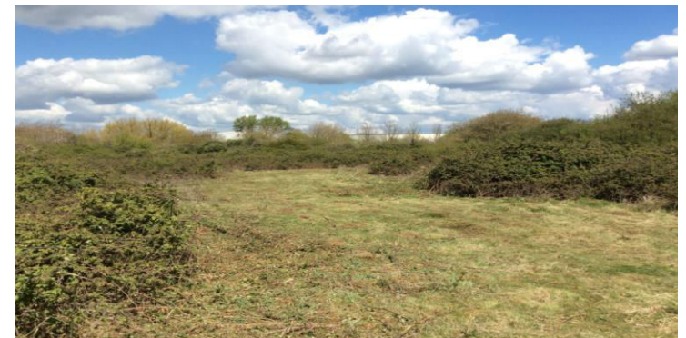
Mitigation/minimisation – displacement of reptiles through habitat manipulation.