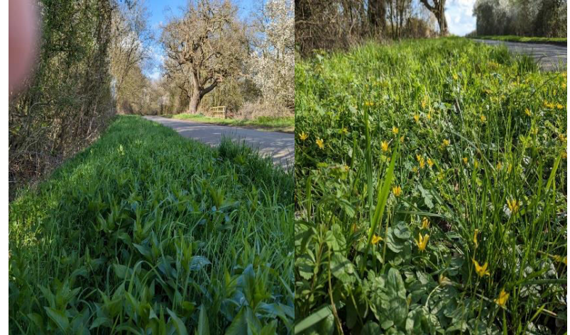
Pictures showing examples of the road verge habitat enhancements (at Year 1 of enhancements – continual)